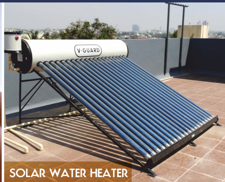
SOLAR WATER HEATER